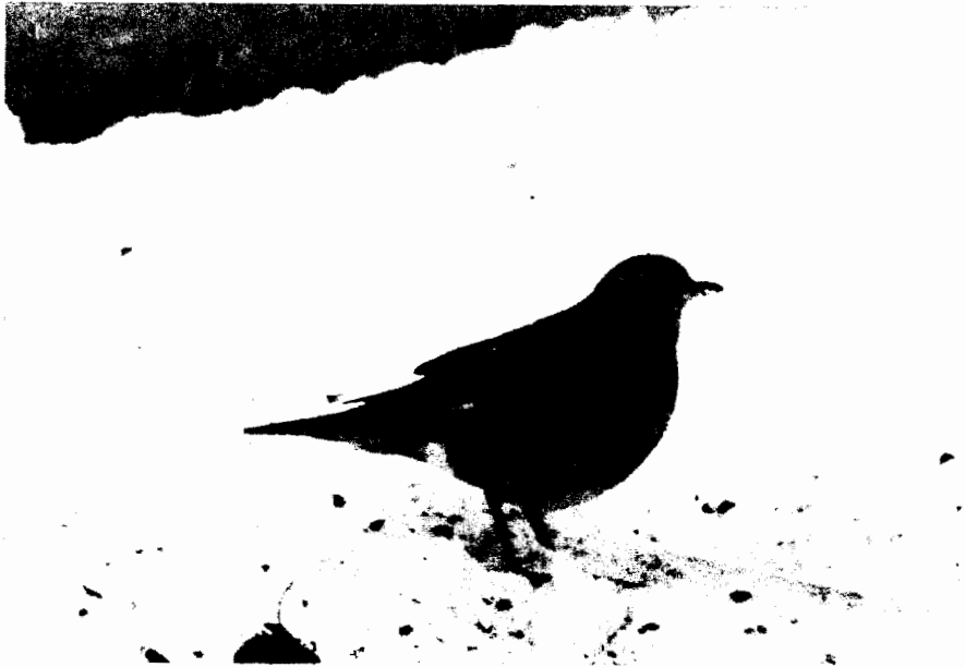
Varied Thrush at Newtown, Pennsylvania on January 7, 1970